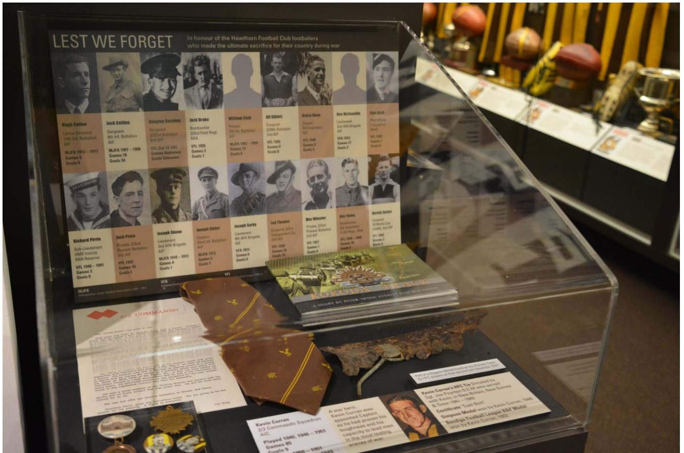
Hawthorn War Service Cabinet