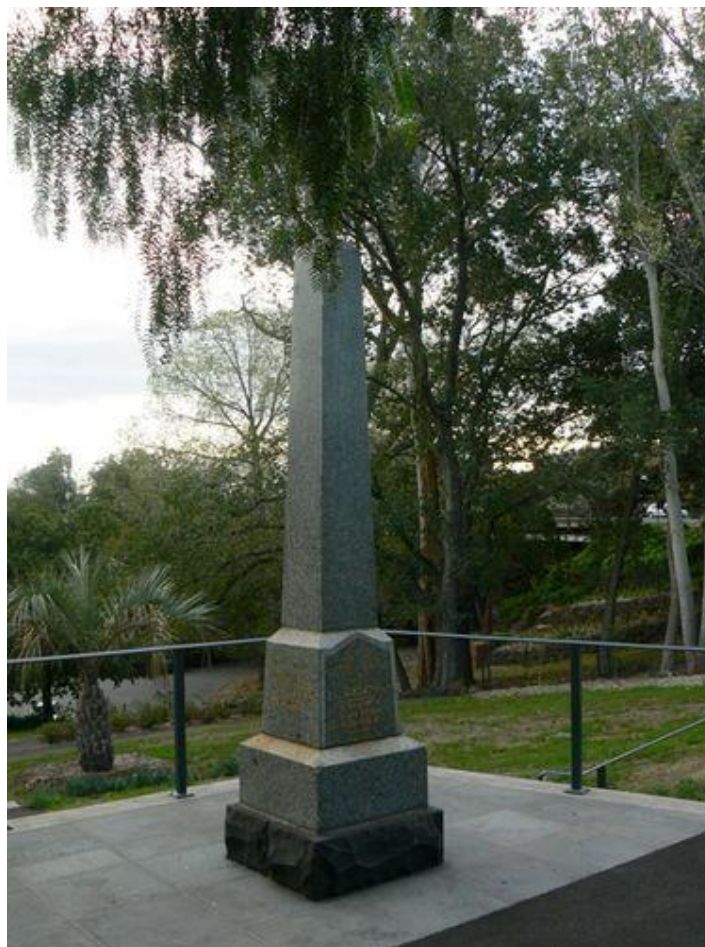
Hawthorn Rowing Club War Memorial