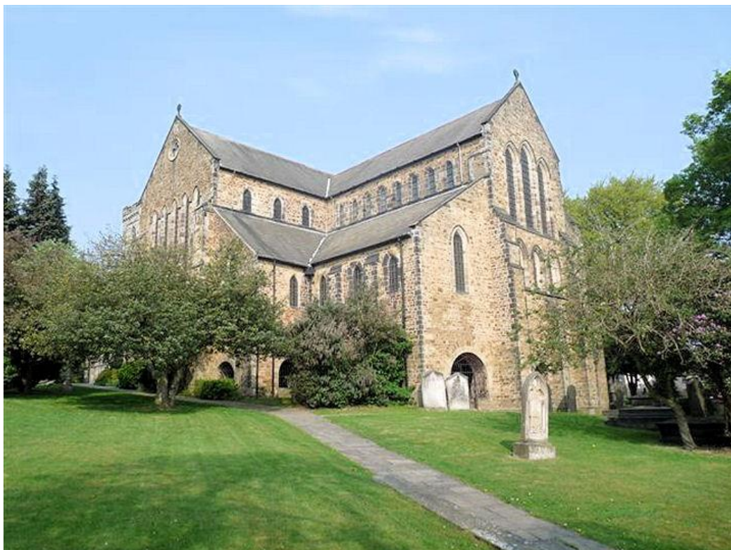
All Saints Church, Ecclesall