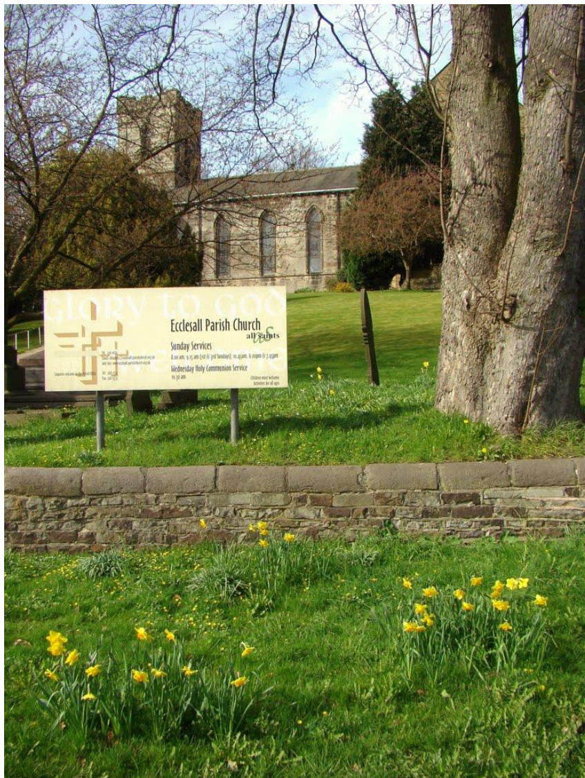
All Saints Church, Ecclesall