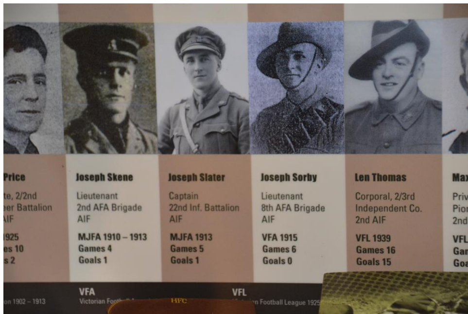
Hawthorn War Service Cabinet