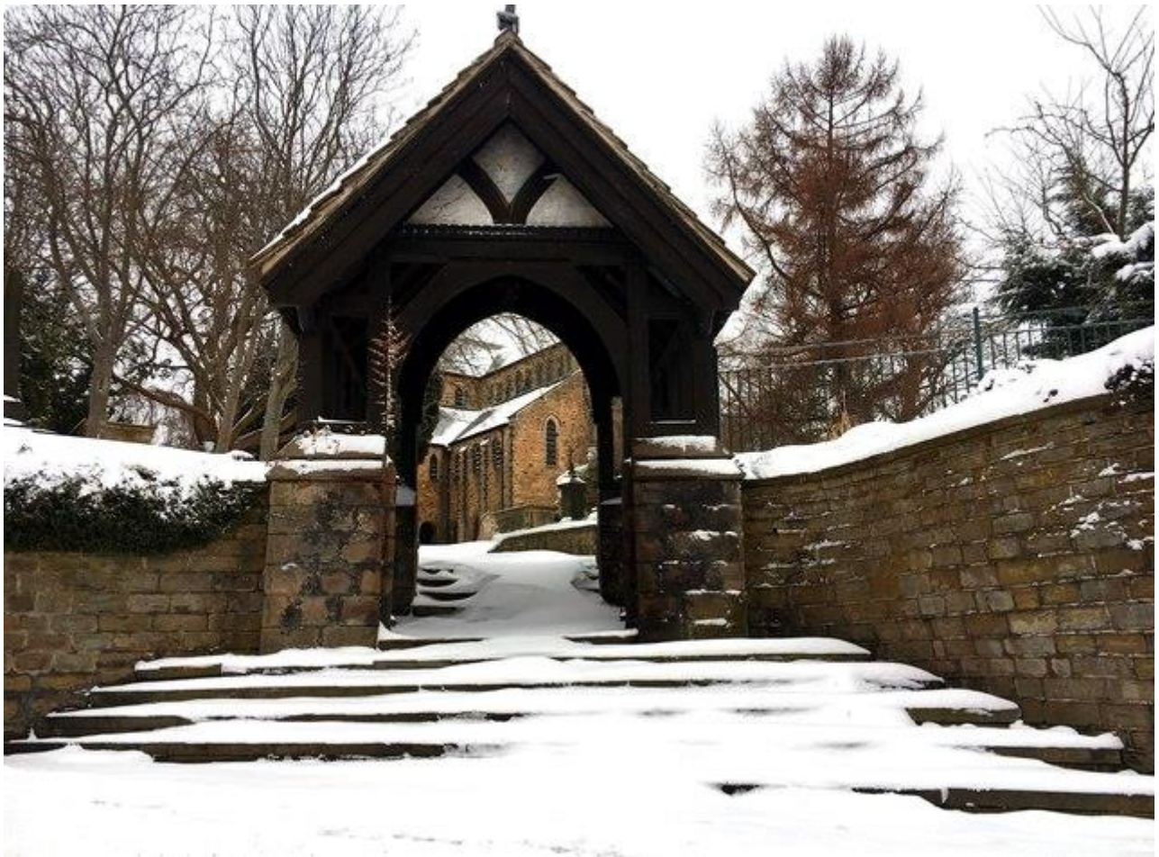
Lych Gate at All Saints Church, Ecclesall

All Saints Churchyard, Ecclesall contains 32 Commonwealth War Graves – 14 from World War 1 & 18 from World War 2.