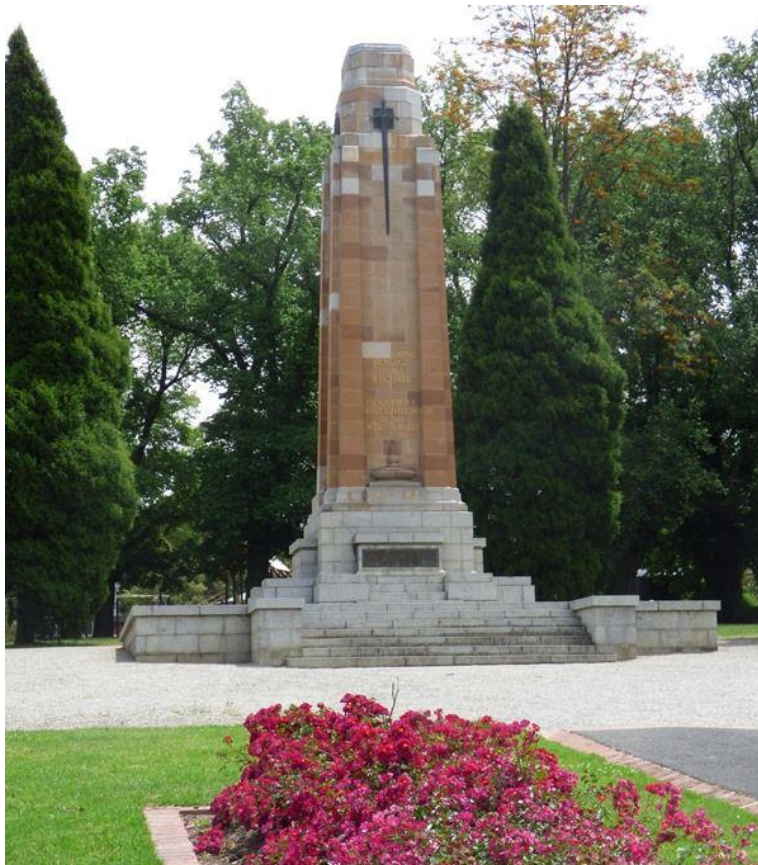
The Hawthorn Cenotaph

The Hawthorn Cenotaph, located in St. James Park, Burwood Road, Hawthorn, Victoria, does not list individual names.